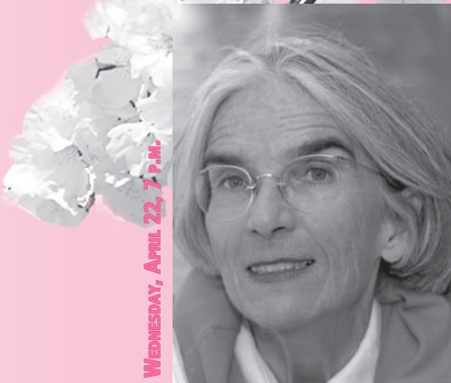
WEDNESDAY, APRIL 22, 7 P.M.