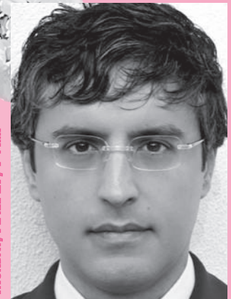
MONDAY, APRIL 27, 7 P.M.