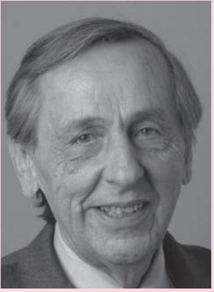
TUESDAY, APRIL 7, 7 P.M.