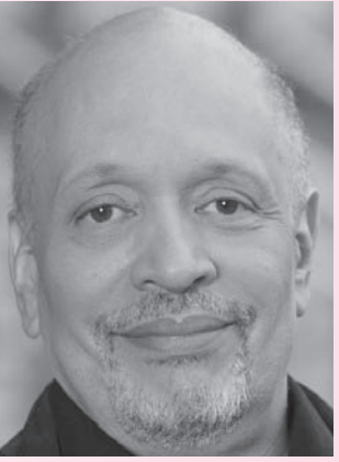
MONDAY, APRIL 6, 7 P.M.

Presented First-Class Mail US Postage PAID Washington, DC Permit No. 2072